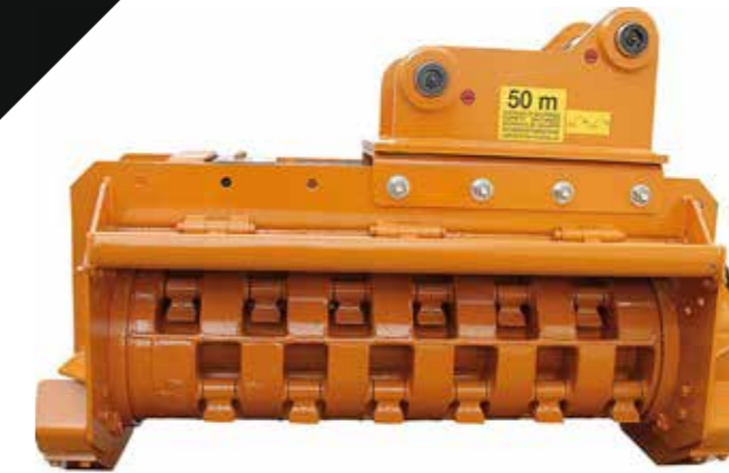
Swinging Hammer Mulcher